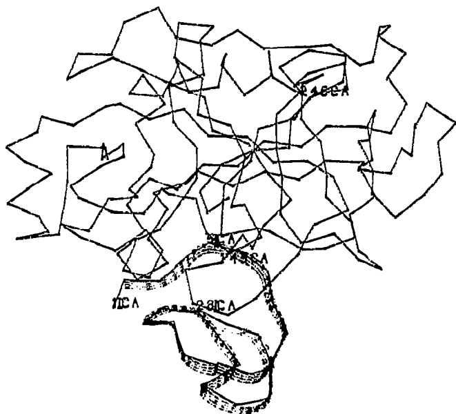
Fig. 2. C \alpha drawing of the complex formed between porcine \beta -trypsin and MCTI-A (highlighted by ribbon diagram).

The inhibitor has no regular secondary structure, except a type-II tight turn at 17I–20I and a type I' tight turn at 23I–26I. One residue (Ala-18I) at the type-II turn shows the conformation outside the allowed region of \varphi - \psi [24], with \varphi=39.7^\circ , \psi=-126.9^\circ .